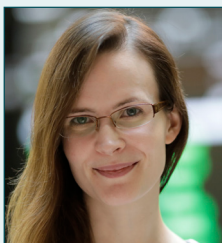
Catherine Talks London Stock Exchange (LSEG)